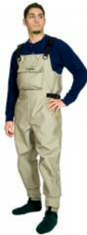
CHEST WADERS STOCKING FOOT 220B