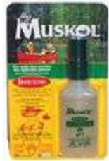
50 ml Pump Spray

Mosquito Coil Muskol Liquid 40 mL Muskol Liquid Pump 50 mL